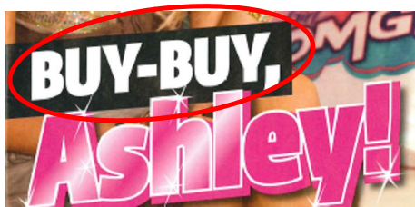
Figure 4: Homophones