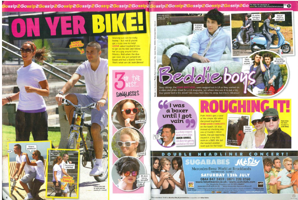
Figure 12: Celebrities' Gossip Column in Top of the Pops (June 08) – Gossip2Go