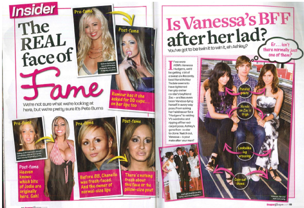
Figure 14: Celebrities' Gossip Column in Sugar (February 09) – Insider