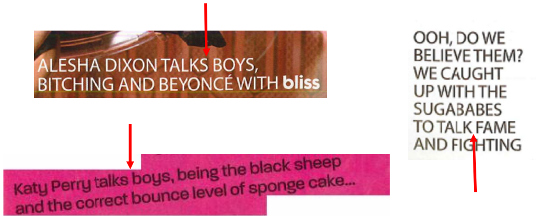
Figure 8: Ellipsis