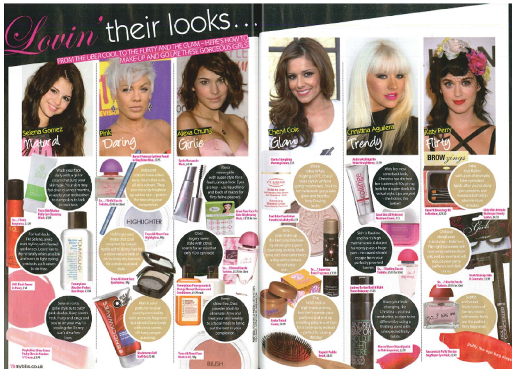
Figure 19: Beauty Column in Bliss (January 09) – BlissStyle