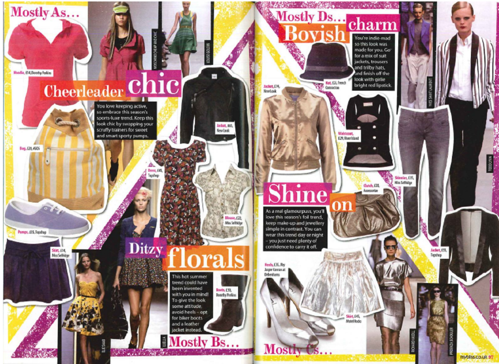
Figure 18: Fashion Column in Bliss (July 08) – BlissStyle