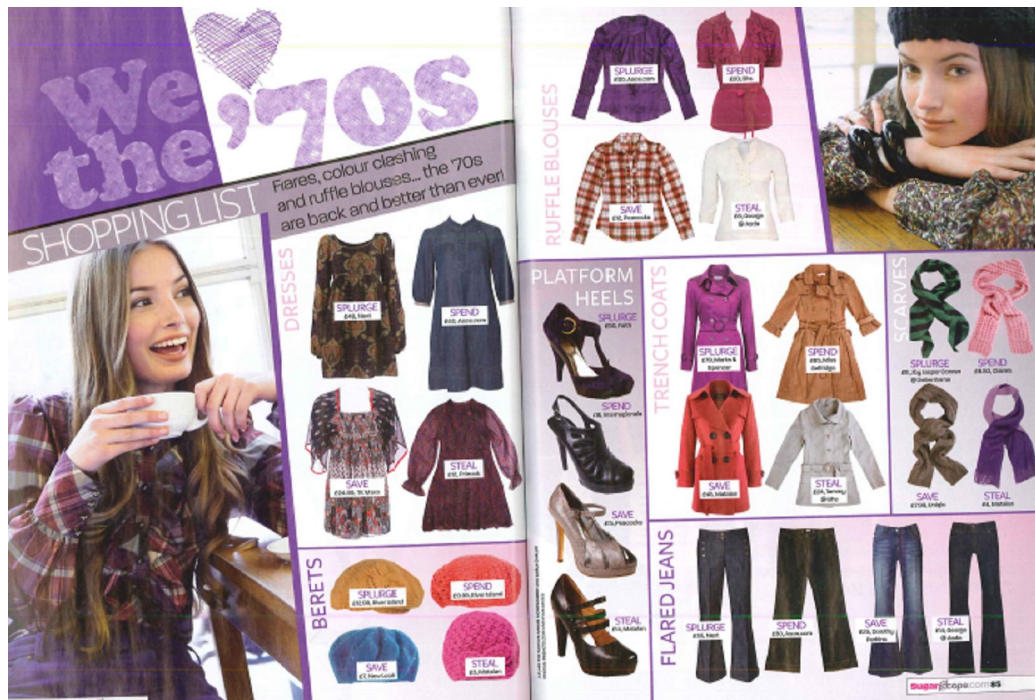
Figure 22: Fashion Column in Sugar (February 09) – SugarStyle