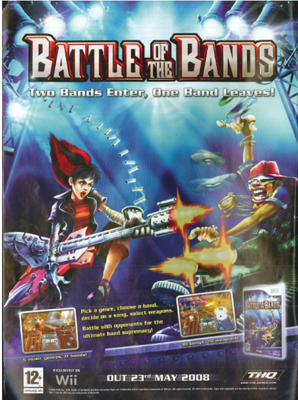
Figure 45: Hobbies Advertisement in Top of the Pops (October 08)