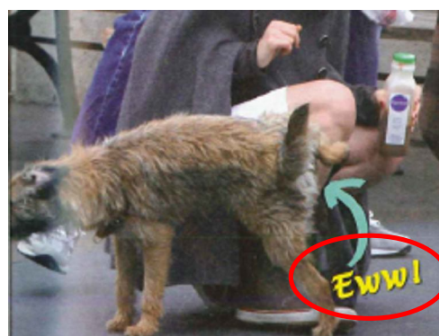
Figure 9: Interjections