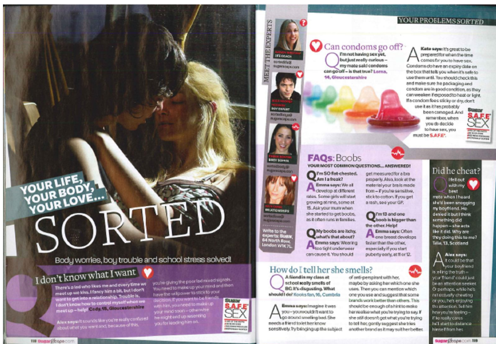
Figure 32: Problem Pages in Sugar (February 09) – Your Problems Sorted!