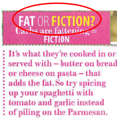
Figure 5: Intertextuality