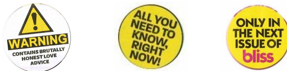
Figure 5: Non-textual Tools Catching Readers' Attention (self-created)

I think that scandalous content participates in tabloids' creation from one half. The second half is represented by a visual depiction through which it is sent to a reader.