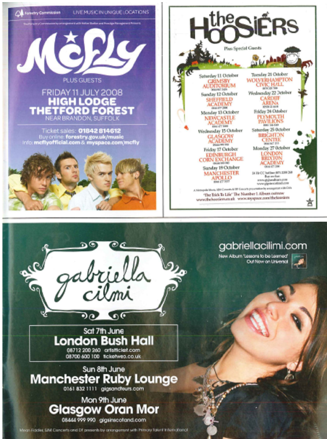
Figure 46: Fun Advertisement in Top of the Pops (June 08)