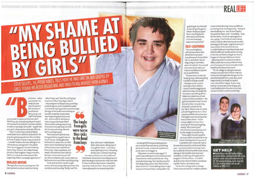
Figure 34: Readers' Life Stories Column in Sugar LadMag (February 09) - RealLife