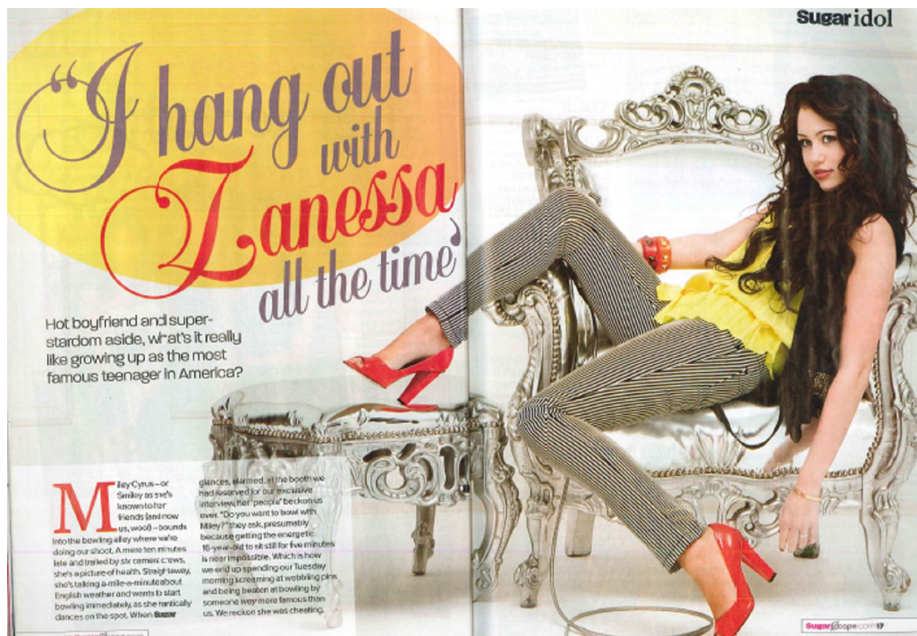
Figure 15: An Interview with a Famous Person in Sugar (February 09) – Sugar idol