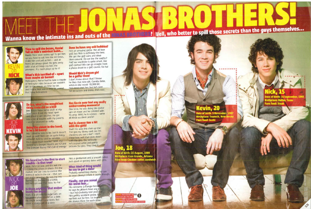
Figure 13: An Interview with a Famous Person in Top of the Pops (June 08)