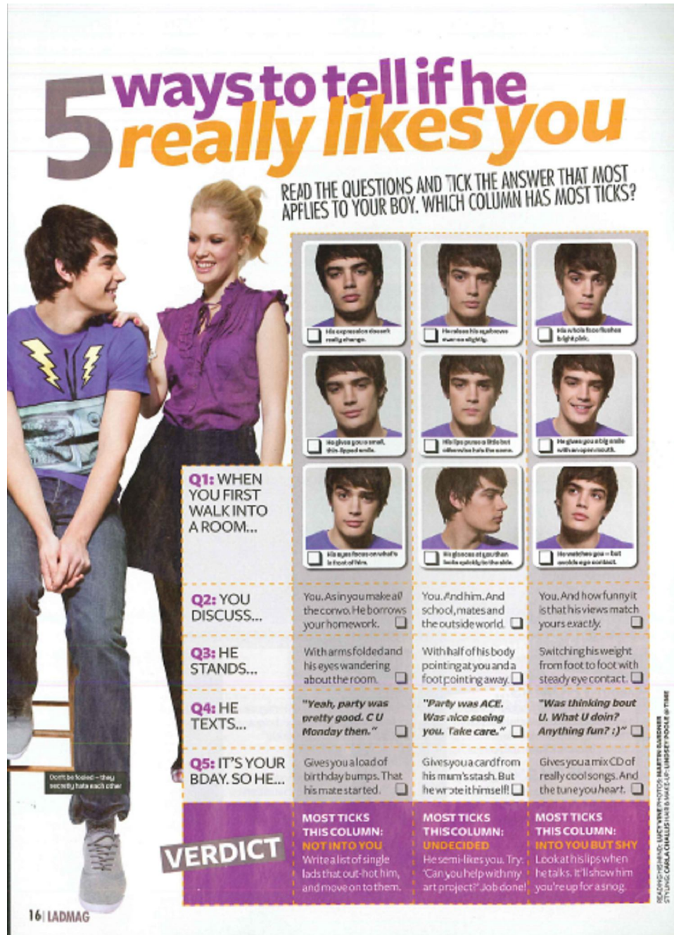
Figure 42: Quiz in Sugar LadMag (March 09)