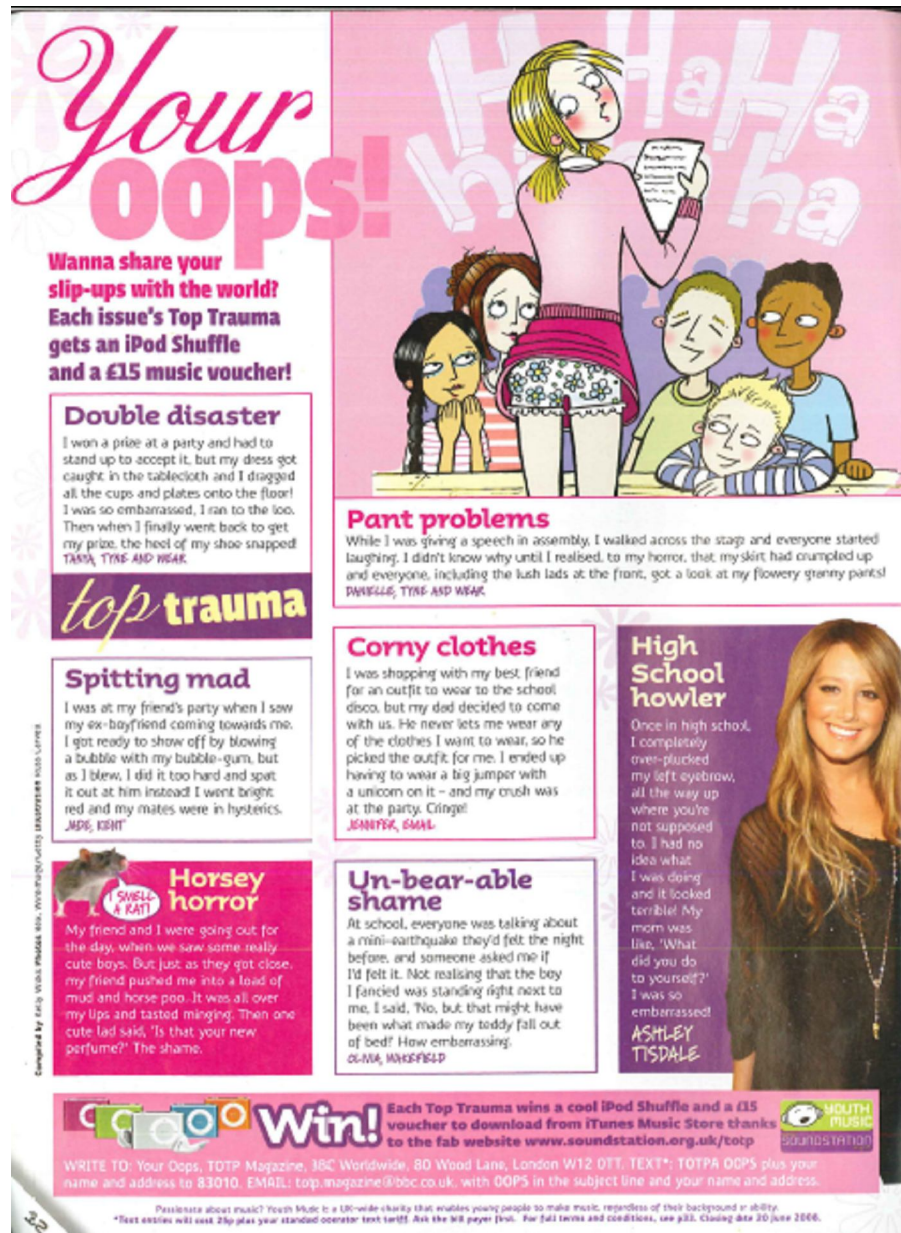
Figure 30: The Column of Contretemps in Top of the Pops (June 08) – Your oops!