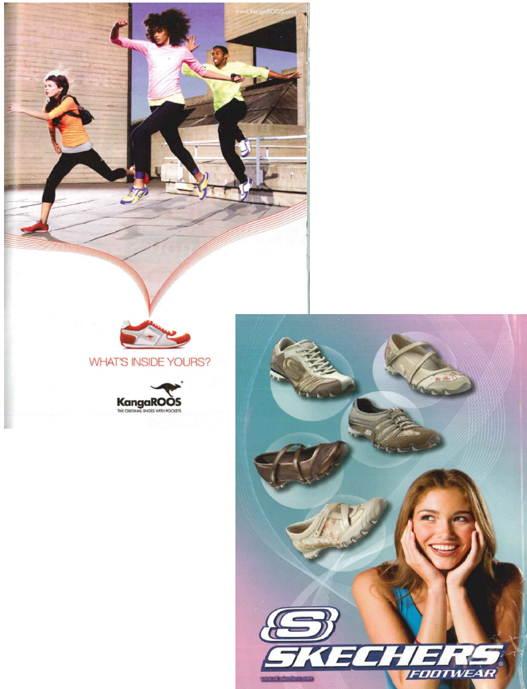
Figure 43: Fashion Advertisements in Bliss (July 08)