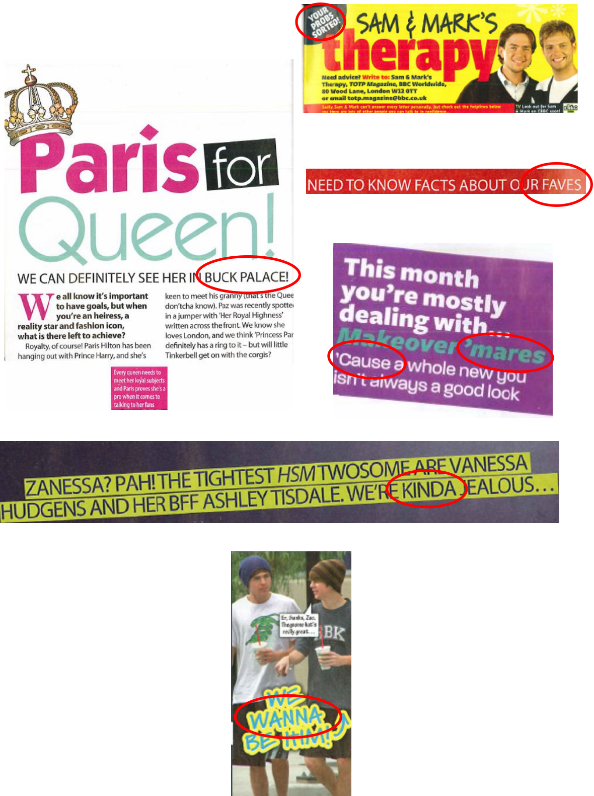
Figure 7: Colloquialisms