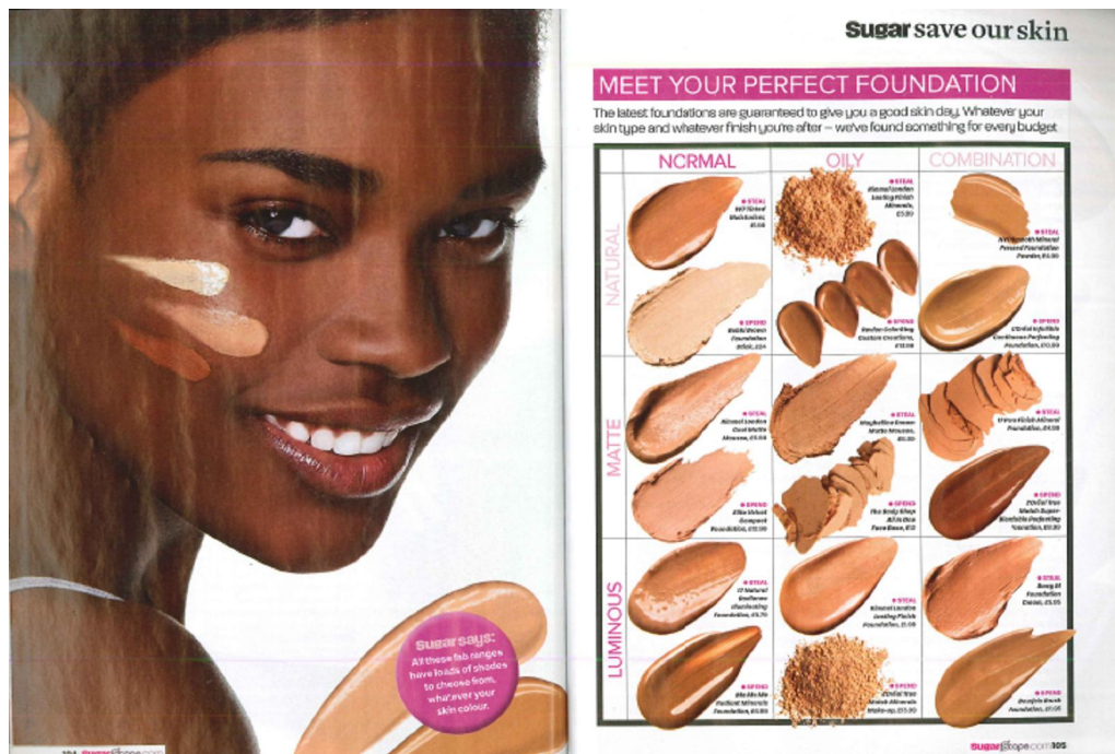
Figure 23: Beauty Column in Sugar (February 09) – SugarStyle