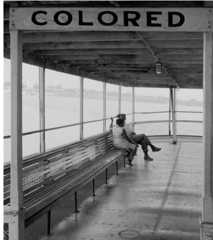
Image 2 – Couple sitting in the colored section of ferry

1907). In 1906, Montgomery, Alabama required a completely separate street car. During these years, segregation was also extended to steamboats. 38