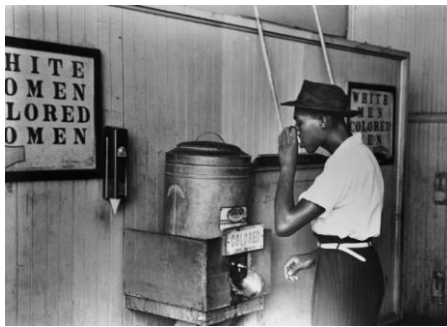
Image 4 – Man drinking at segregated drinking fountains

Furthermore Jim Crow laws became very concerned with the segregation of employees and their working conditions. “In most instances segregation in employment was established without the aid of statute. And in many crafts and trades the written and unwritten policies of Jim Crow unionism made segregation superfluous by excluding Negroes from employment.” For instance, the South Carolina code of 1915 prohibited textile factories from allowing workers of different races working together in the same rooms, using the same entrances or stairs, exits, toilets, basins, cups or glasses. Only firemen, floor scrubbers and repairmen were an exception. 40