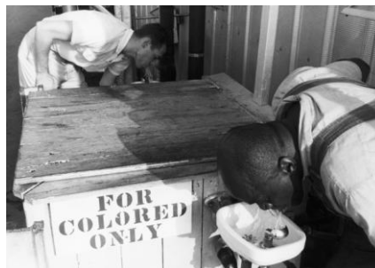
Image 3 – Men drinking from segregated water fountains

The Jim Crow laws were administrated by city ordinances or by local regulations and rules enforced without the formality of laws. The streets and avenues began to fill with signs: “Colored only” or “Whites only.” Sometimes the restrictions went far over the top, limiting blacks to certain inches in a room and in one case to a color of paint. Very often public facilities and their entrances and exits, theatres and boarding houses, toilets and water fountains, waiting rooms and ticket windows were separated. 39