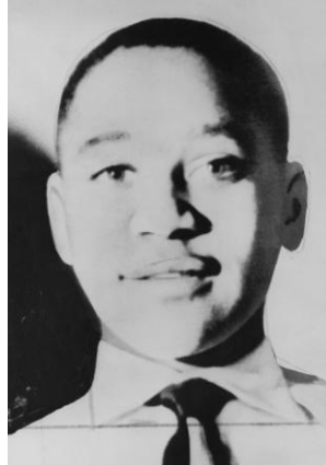
Image 1- Portrait of Emmett Louis Till

-Hugh White, Governor of Mississippi, 1955 1