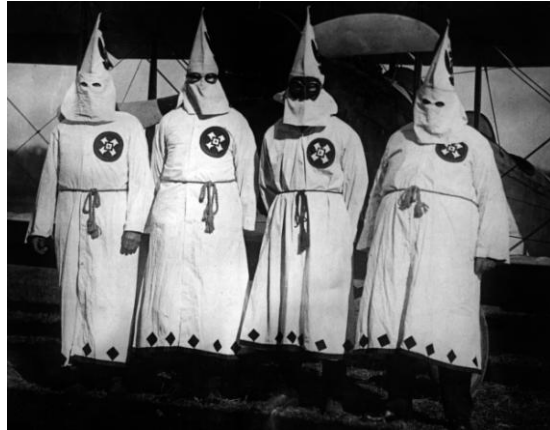
Image 8 – Four klansmen about to take off for a leaflet raid

were a direct threat to America. That was a paradox as America was supposed to be the land of the free but instead America passed laws to restrict immigrants. 63