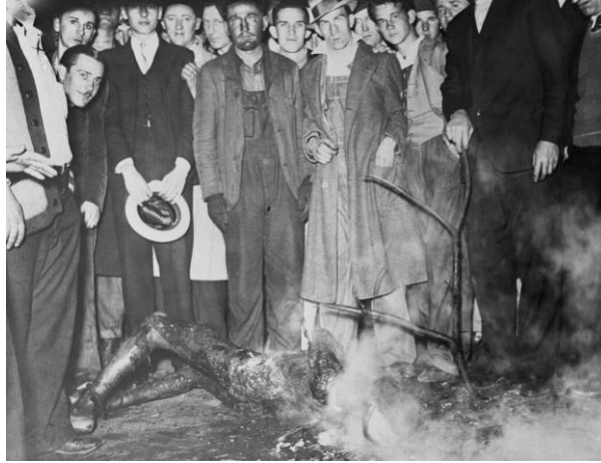
Image 10 – Men displaying body of a lynched victim, St. Joseph, Missouri