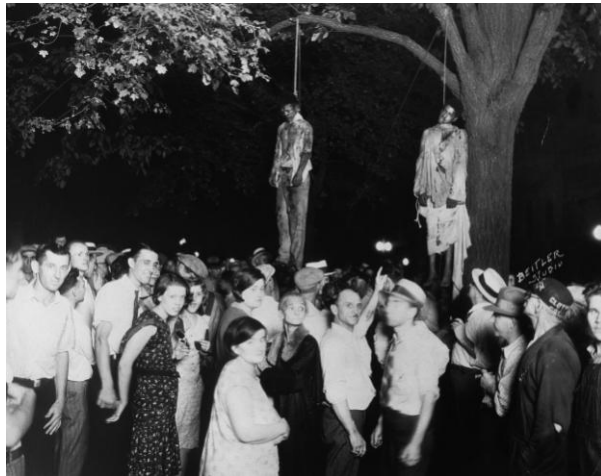
Image 11 – Two black men are lynched in the public square in Marion, Indiana

Incredible cruelty, violence and racial segregation, which still strongly ruled the days, not only separated the two races but also supported whites in their belief that blacks were not even worth respect. Not only did it deprive blacks of their fundamental rights but it also created an unbelievable racial bias with which whites treated blacks. It was supposed to be separate but equal but it was rather separate and unequal. As a doctrine it could never work in the society.