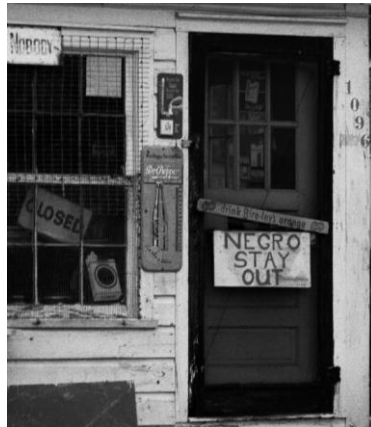
Image 6 – Store with racist sign in Sumter, South Carolina