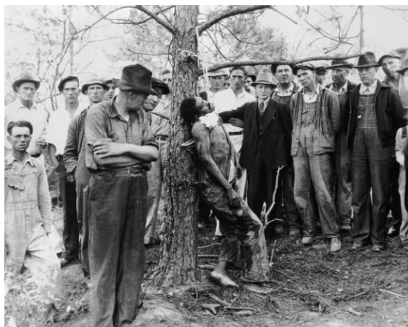
Image 9 – Farmers around hung black man, Royston, Georgia

President Franklin Delano Roosevelt promised A New Deal to America that would return it to the economic prosperity of the 20s. To do so, he kept people busy through a series of “alphabet soup” programs such as the Works Progress Administration (WPA). Roosevelt also appeased the populace through weekly fireside chats, in which he was ensuring Americans that everything would be alright. However, not everything was alright. The middle white class was competing with the lower black class over jobs, which angered whites and resulted in increased sufferings among black people. Whites often turned to violence against blacks, lynching them or burning them to death.