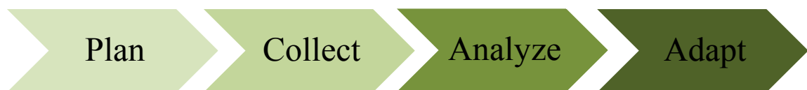
Figure 3 Model of Benchmarking EFQM (Nenadál, Vykydal, and Halfarová 2011, 31)

The last model of benchmarking was created by European Foundation for Quality Management (EFQM). The whole benchmarking is distinguished among these four stages: